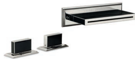
DP 1268 FIFTH WALL MOUNTED BATH SPOUT WITH DECK CONTROLS