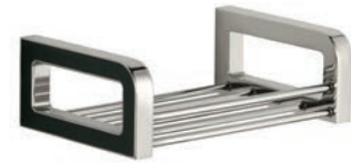
DP 4603 FIFTH SHOWER SOAP DISH