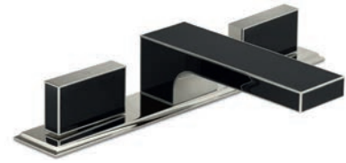
DP 1226 FIFTH 3 HOLE BASIN MIXER ON SINGLE PLINTH WITH CLICK-UP WASTE