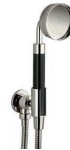
DP 1826 FIFTH WALL MOUNTED HAND SHOWER