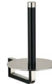
DP 4601 FIFTH SPARE PAPER HOLDER