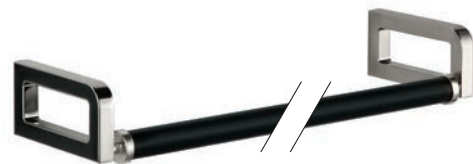
DP 4608 FIFTH 18" TOWEL RAIL