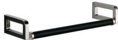
DP 4607 FIFTH 12" TOWEL RAIL