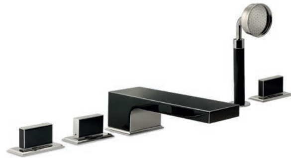
DP 1259 FIFTH DECK MOUNTED 5 HOLE BATH SET WITH PULLOUT HAND SHOWER