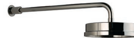
DP 1875 FIFTH 8" APRON ROSE WITH LONG ARM SUITABLE FOR LARGE CUBICLE OR BATH SHOWERS