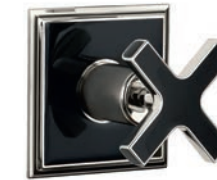
DH 5000 FIFTH WALL MOUNTED FLOW CONTROL CROSS HANDLE