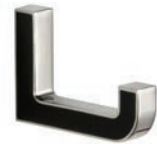
DP 4605 FIFTH HOOK