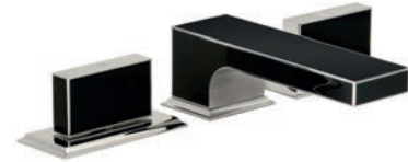
DP 1227 FIFTH 3 HOLE BASIN MIXER ON SEPARATE PLINTHS WITH CLICK-UP WASTE