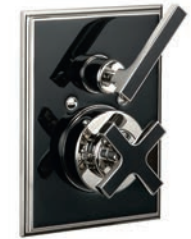
DP 8716 FIFTH CONCEALED THERMOSTATIC SHOWER VALVE WITH 8" ROSE, HAND SHOWER AND SHOWER KIT