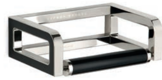
DP 4600 FIFTH PAPER HOLDER