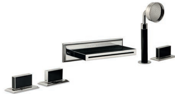
DP 1269 FIFTH WALL MOUNTED 5 HOLE BATH SET WITH PULLOUT HAND SHOWER