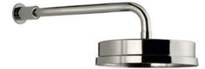
DP 1874 FIFTH 8" APRON ROSE WITH SHORT ARM SUITABLE FOR CUBICLE SHOWER