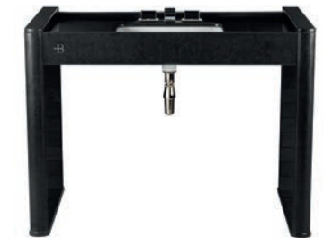
LB 6342 BK PIANO BATHROOM CONSOLE IN BLACK POLISHED GRANITE, INCL. CERAMIC UNDER-MOUNT BASIN LB 7250