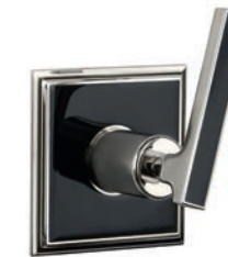
DL 5000 FIFTH WALL MOUNTED FLOW CONTROL LEVER