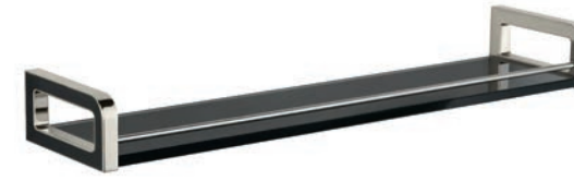
DP 4611 FIFTH GLASS SHELF