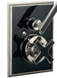
DP 8706 FIFTH CONCEALED THERMOSTATIC SHOWER VALVE