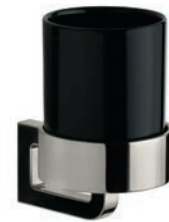
DP 4604 FIFTH MUG HOLDER