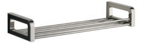
DP 4612 FIFTH BOTTLE RACK