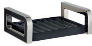
DP 4602 FIFTH CERAMIC SOAP DISH