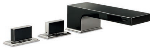
DP 1239 FIFTH DECK MOUNTED 3 HOLE BATH MIXER